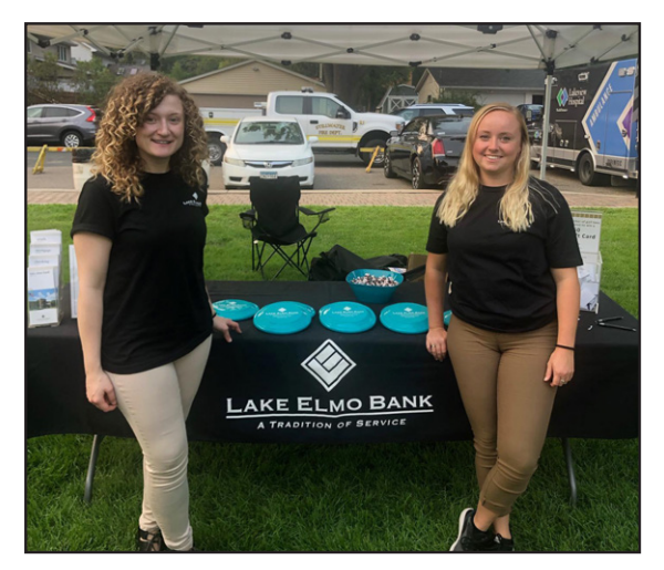
Our LEB Street Team was busy as we participated in both Lake Elmo and Stillwater's Night-to-Unite community events.